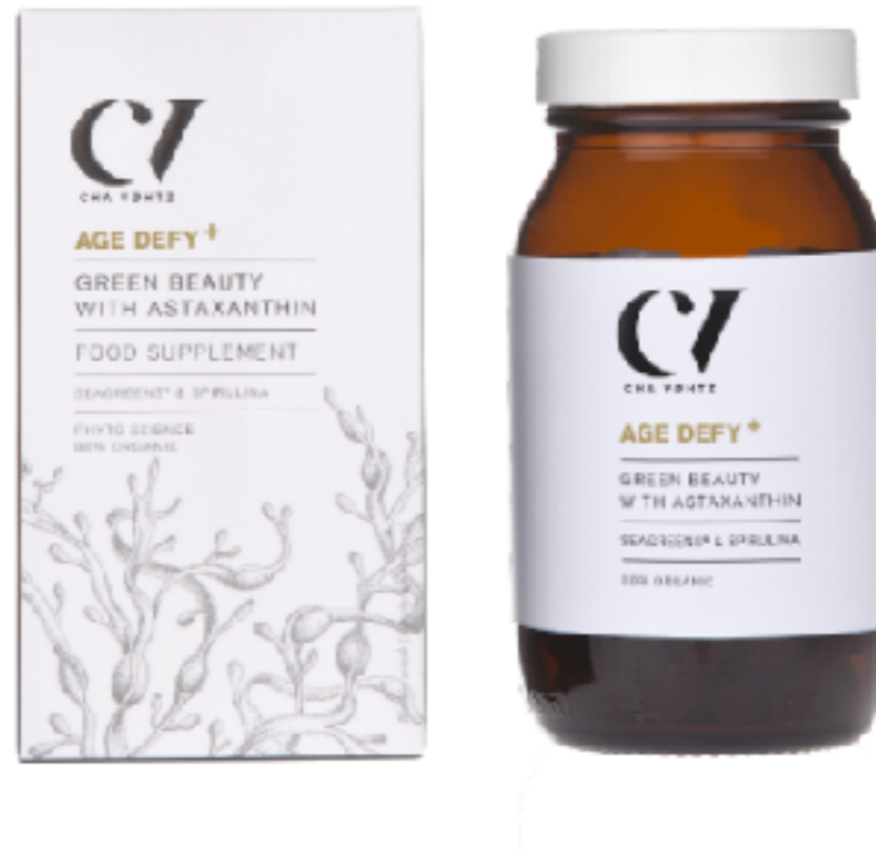
Green Beauty supplements | greenbeauty

Beauty from the inside out is no longer a buzz word but instead it's really more of an accepted way of life. A 60-capsule formula, Green Beauty with Astaxanthin has been designed with six nutrient-rich superfoods - Astaxanthin, Seagreens, Seaweed, Barley grass, Wheatgrass, Spirulina and Chlorella to help support the signs of ageing and protect against the effects of pollution, UV light and immune stress.