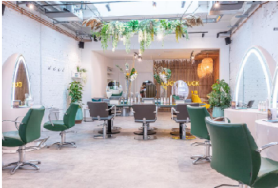
Duck and Dry: breakfast and blow dry service. our space

In 2014 Yulia opened doors to the Duck & Dry flagship store in Chelsea. And since then the brand has gone from strength to strength. Known as social beauty spaces, they now have outposts in five locations including Chelsea, Oxford Circus, Mayfair and Spitalfields. As well as quick and clever blowdries, they offer nails and brows too. Always reinventing the wheel, in January, for example, they partnered with Rude Health, offering clients a complimentary breakfast alongside any morning blow dry. And this month, they've announced a new franchise model, so it's safe to say we will shortly be seeing more of these successful salons cropping up around town.